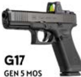
G17 GEN 5 MOS