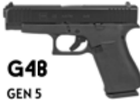
G48 GEN 5