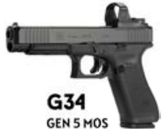
G34 GEN 5 MOS