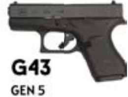
G43 GEN 5