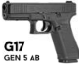
G17 GEN 5 AB