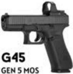
G45 GEN 5 MOS