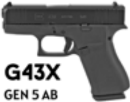
G43X GEN 5 AB