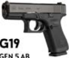
G19 GEN 5 AB