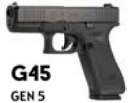
G45 GEN 5